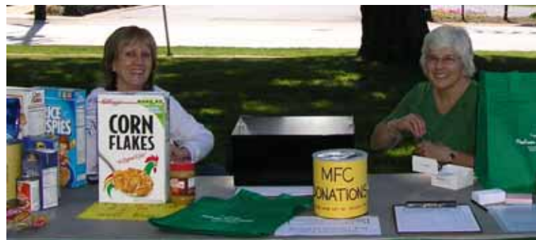
Madison Food Center