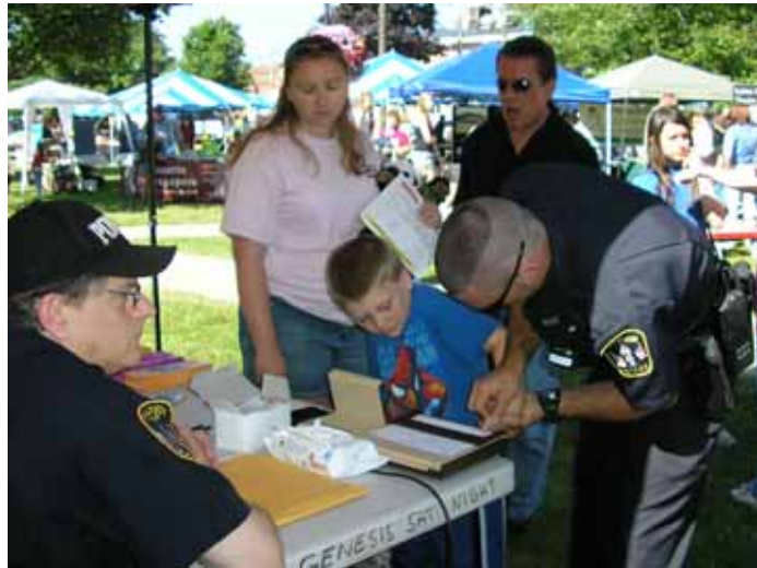
Children's Fingerprinting provided by Madison Village and Township Police

Safire Rose Beads & Things Stony Glenn Town Shopper Magazine Twin Vinyl Inc. Wagon Wheel Bar & Restaurant Walker Floors & Home Interiors